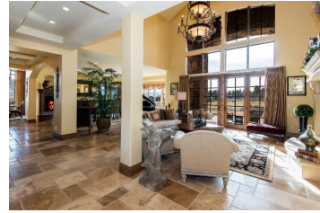
6340 Fleur Court $835,000 2,366 sq ft, 3 bedrooms, 2 bathrooms, 1 half bath, 2 car garage Maintenance free home