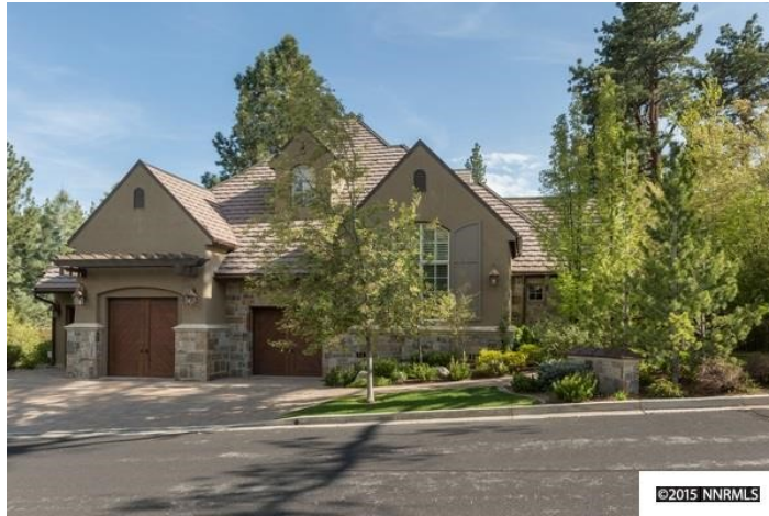
6594 Champetre Creekside Manor $1,299,000 PENDING 3,100 sq feet, 3 bedrooms 2 bathrooms, 1 half bath, 3 car garage The finest quality that Montreux has to offer.